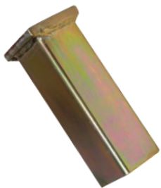
Post Cap Protector