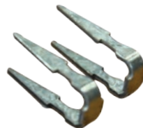
High Tensile Staples