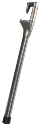
Post Opening Tool