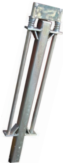
Double Impact Thumper